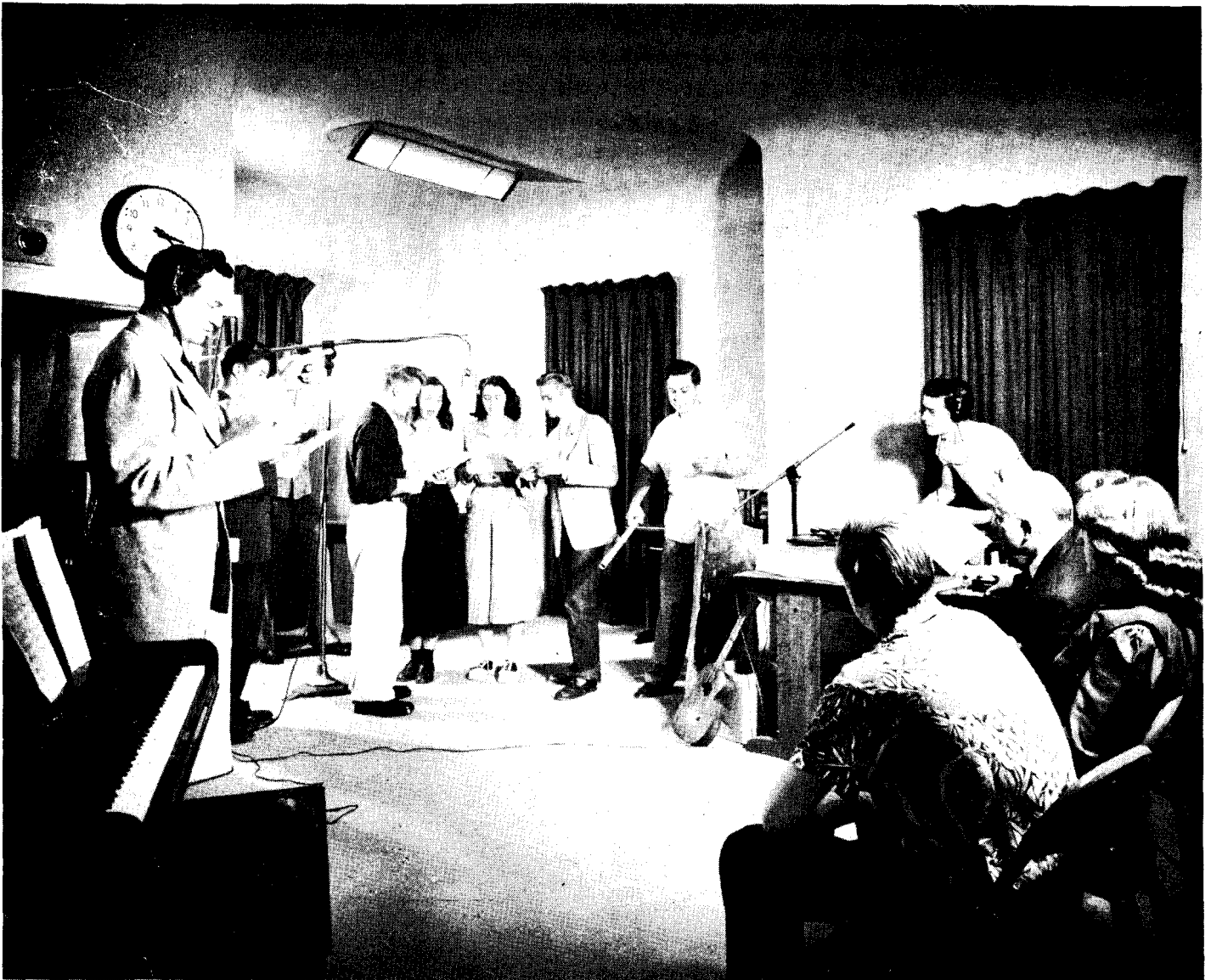
Broadcast Studio: Radio Drama being recorded.

the campus during the next five years. These plans contemplate erection of three new buildings and other changes, improvements and additions, which will provide Ambassador College with a truly fine and thoroughly adequate plant in every respect. Work is now proceeding on clearing and developing the new athletic field, adjoining the campus across Terrace Drive, to the east. We expect to have this in operation for softball by spring. The growth and development of Ambassador College during its four and a half short years is nothing short of miraculous.